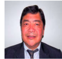
PDS Abo Gempesaw