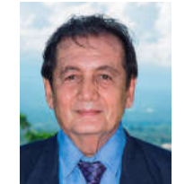
Pres Rudy Togle